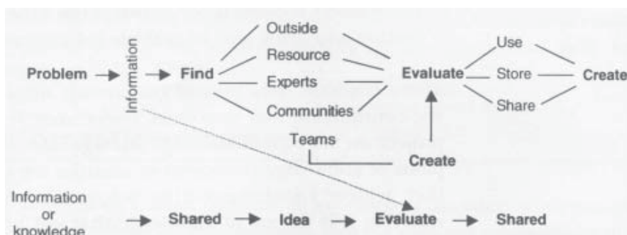
Fig. Information flows and problem solving.