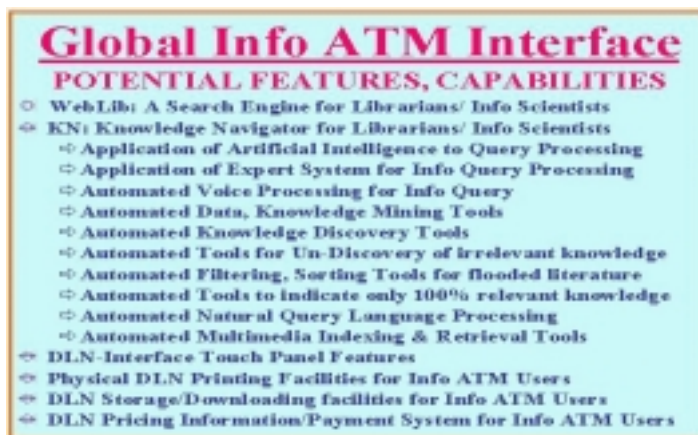
Fig 2: Global Info ATM Interface with possible features and capabilities

Every Library should have an Info ATM Interface infrastructure for accessing the Digital Libraries Network for local, national, regional and global access to digital information resources. This Info ATM should be like Bank ATM with facilities like Printing, Storage, Downloading, Printing Facilities, Big Touch Screen with integrated access to library resources and DLN-based digital resources.