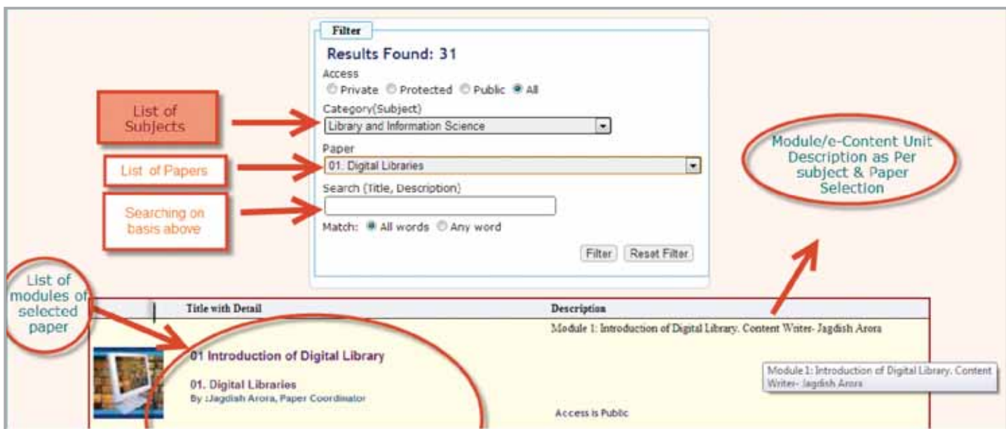
Fig-2: Student corner to access their course materials