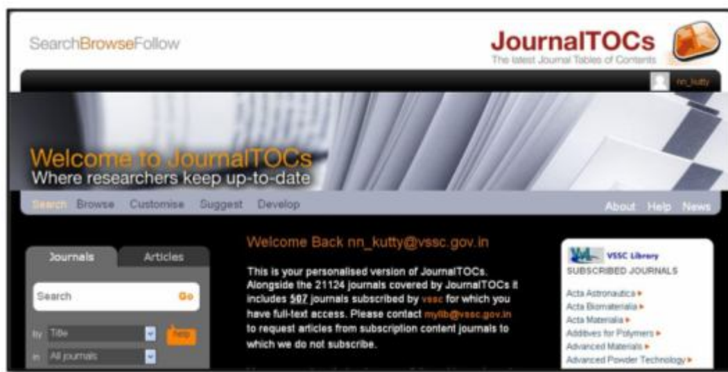
Figure 2 : VSSC JournalTOCs

VSSC Library introduced JournalTOCs from March 2012 by formally registering for a trial implementation. After testing and further customization the service was formally subscribed from September 2012. The first Indian JournalTOCs premium installation is in VSSC Library. This is one of the services deeply appreciated by the library patrons. At present 200 users are following 700 journals.