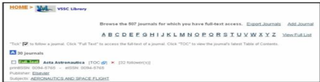
Figure 11: A-Z List of VSSC Online Journals

As part of the subscription to the premium edition of JournalTOCs each library is provided with an A-Z list of subscribed online journals (image -11). This helps the user to navigate through the journals. The list is organized alphabetically with an option to select a journal to follow. Links are provided to the link resolver, journal home page, subject category, and publisher. As the JournalTOCs A-Z list covers only online titles a link to the View full list (E-resources) portal to view library holdings is provided. VSSC A-Z list is available only for institutional login and can be used to select a journal to follow on and off campus. The super-user login can export the full list, and add/remove title to/from this page. Link to A-Z is provided on all important screens for easy access.