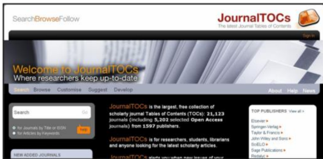
Figure 1 : Journal TOCs Homepage

the virtual space for researchers to keep-up-to-date and librarians to be with the users. Publishers receive best ROI by partnering with this service, as their journals are marketed all over the world with the active participation of library patrons, librarians, academicians, students and anyone who uses this service.