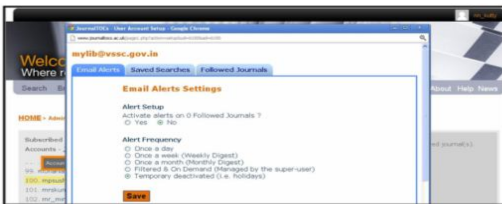
Figure 3: Super-Admin Control Panel

Each registered institution is provided with one Super-Admin-account (Image -3). Depending upon the requirement, additional admin accounts can be requested with restricted admin rights. A separate customized admin interface is provided for each institutional subscription to manage the user account and subscribed journals. Library can manage the activities easily with this user-friendly control panel.