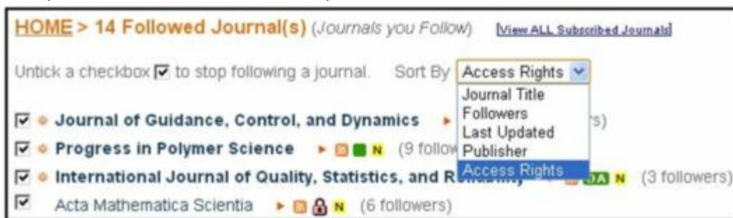
Figure 8 : List of followed journals with filter parameters