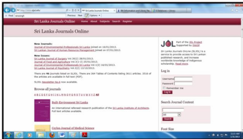
Figure 2: Sri Lanka Journals Online Website

Sri Lanka Journals OnLine (SLJOL) is a service to provide access to Sri Lankan published research, and increase worldwide knowledge of indigenous scholarship (Figure 2). It is a database of journals published in Sri Lanka, covering the full range of academic disciplines. The objective of SLJOL is to give greater visibility to the participating journals, and to the research they convey.