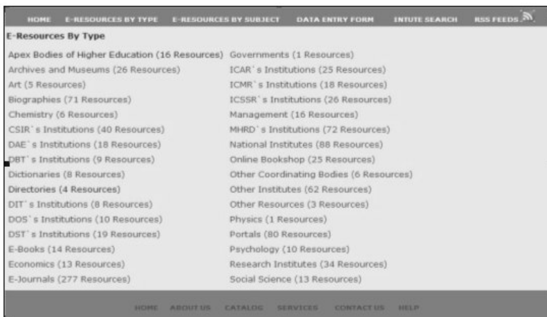
Figure 2: E-Resources by Type

This page is to display E-resources by type. User can browse to available resources by its type with available resources in the bracket.