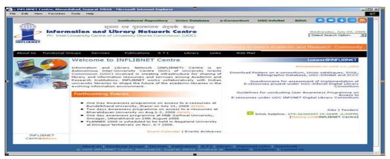
Launching of New Website of the INFLIBNET Centre

The occasion was also used for launching of a new website of the INFLIBNET Centre and release of posters and latest Annual Reports of the Centre.