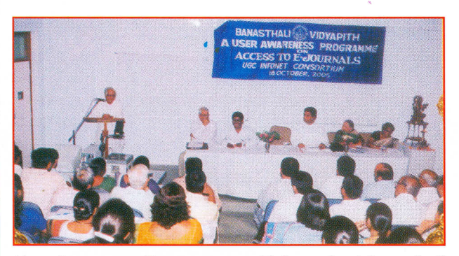
User Awareness Programme on E-Journals at Banasthali Vidyapith