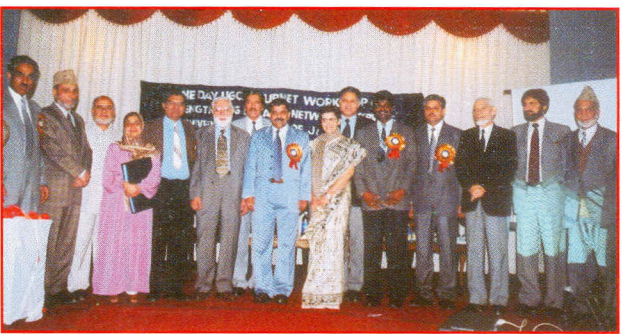
INFLIBNET workshop on strengthening Networking and Library Services in Universities and Colleges of Jammu and Kashmir held in Srinagar