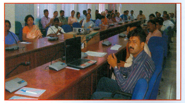
Participants in User Awareness Programme on E-Jounals at Jawaharlal Nehru University New Delhi.