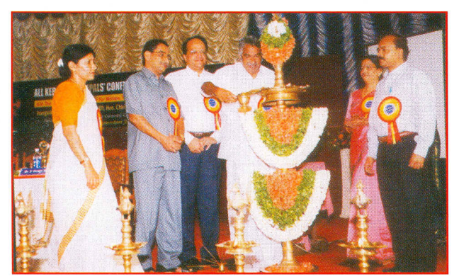
Hon'ble Chief Minister of Kerala Sh. Oommen Chandy inaugurating the "All Kerala College Principals Conference" at Trivandrum