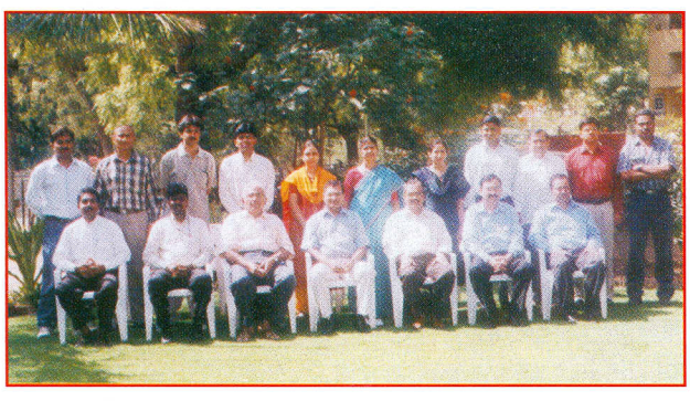
Training Programme on Installation and Operations of SOUL Software held during 18<sup>th</sup> July 22<sup>nd</sup> July 2005