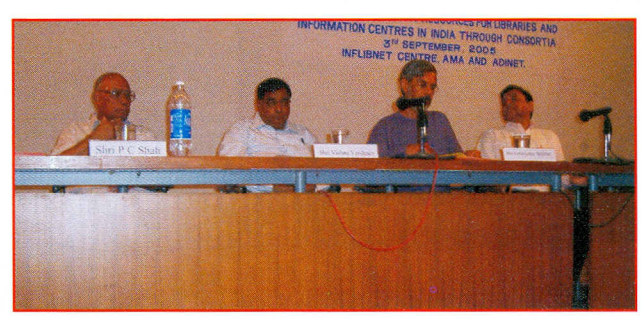
Librarian's Day 2005 Celebrated September 3, 2005