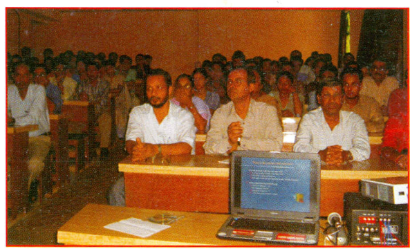
User Awareness Programme on E-Journals at Dibrugarh University Participant's view