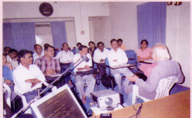
Prof. Yash Pal interacting with participants of 28 th SOUL Training Programme in October, 2004