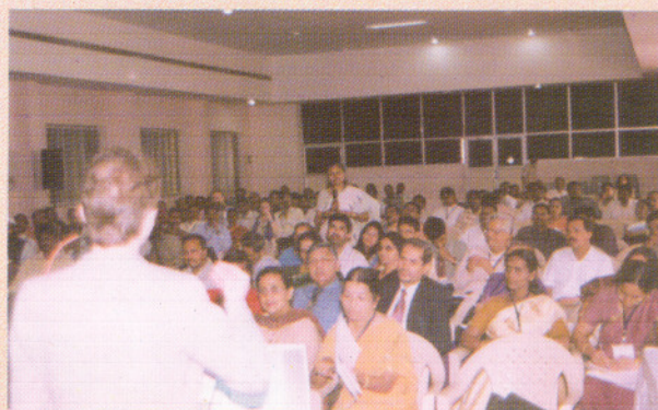
Technical Session is in progress at International CALIBER 2005.

The topics covered in this Year's international CALIBER-2005 featured a combination of innovative technology- Multilingual Computing – Information Management – Networking- Digital Environment to bring more efficiency, agility and continuity in the Library and Information services. Total deliberations of CALIBER-2005 were divided into five technical sessions under four sub-themes viz. 'Content and Information Management', 'Multilingual Computing and Natural Language Processing', 'Digital Libraries and Services' and 'Digital Information Processing and Interoperability'. The proceeding, containing eighty-six full text papers and a number of abstracts, presented in the form of well organised and edited volume, was brought out as pre convention publication. Each sub theme had presentation of invited theme paper from a well-known professional.