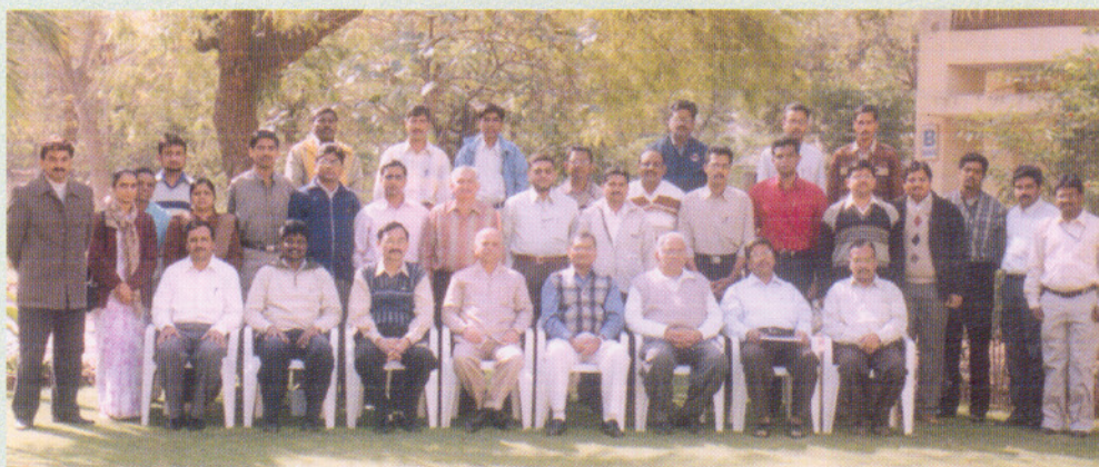
31 st Training Programme on Installation and Operations of SOUL Software held during 21-25, February 2005