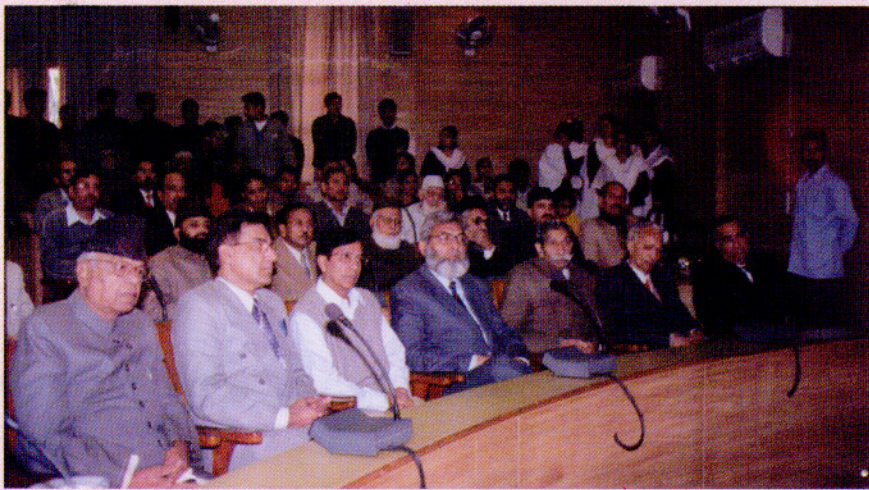
A view of audience during inauguration of Workshop on Building Digital Libraries using DSpace held at Aligarh Muslim University