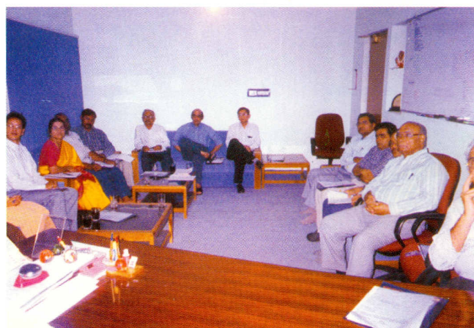
The second meeting of the 'Project Advisory Committee' of the NISSAT Sponsored project on "Developing and Managing a Web Enabled Database of Experts Manpower Module in the Area of Science and Technology" held at INFLIBNET Centre Ahmedabad on 26 April, 2002.