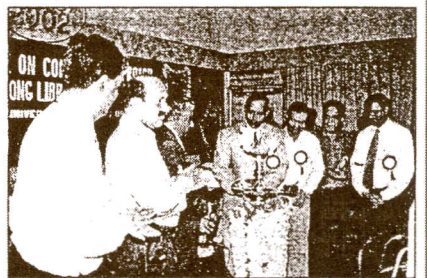
ಮಂಗಳೂರು ವಿಶ್ವವಿದ್ಯಾನಿಲಯದ ಮಾಹಿತಿ ಹಂಚಿಕೆ ಮತ್ತು ವಿನ್ಯಾಸ ವಿಭಾಗದ ಅಧ್ಯಕ್ಷರು ಅಧ್ಯಕ್ಷತೆಯಲ್ಲಿ 27 ಕೋಟಿ ರೂಪಾಯಿ ಅಂದಾಜಿನಲ್ಲಿ ಮಂಡಿಸಿರುವ 'ಯುಜಿಸಿ ನೆಟ್' ಸ್ವಾಪನೆಯ ವಿನ್ಯಾಸವನ್ನು ಸರ್ಕಾರದ ಅಧಿಕಾರಿಗಳು ಪರಿಶೀಲಿಸುತ್ತಿದ್ದಾರೆ.

ಈ ಸಂದರ್ಭದಲ್ಲಿ ಮಾಹಿತಿ ಹಂಚಿಕೆ ಮತ್ತು ವಿನ್ಯಾಸ ವಿಭಾಗದ ಅಧ್ಯಕ್ಷರು ಅಧ್ಯಕ್ಷತೆಯಲ್ಲಿ 27 ಕೋಟಿ ರೂಪಾಯಿ ಅಂದಾಜಿನಲ್ಲಿ ಮಂಡಿಸಿರುವ 'ಯುಜಿಸಿ ನೆಟ್' ಸ್ವಾಪನೆಯ ವಿನ್ಯಾಸವನ್ನು ಸರ್ಕಾರದ ಅಧಿಕಾರಿಗಳು ಪರಿಶೀಲಿಸುತ್ತಿದ್ದಾರೆ.