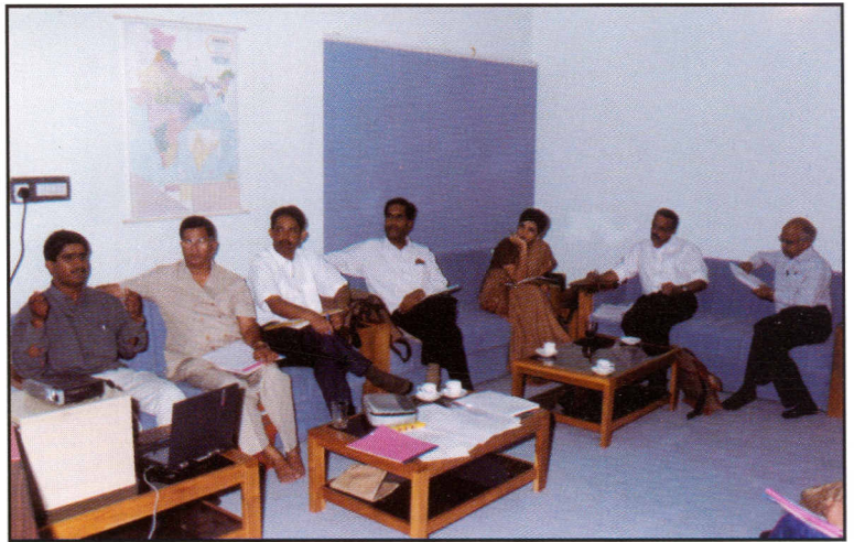
Meeting of the Vice Chancellors and Librarians of the six universities at INFIBNET Centre for e-journal consortium initiatives.