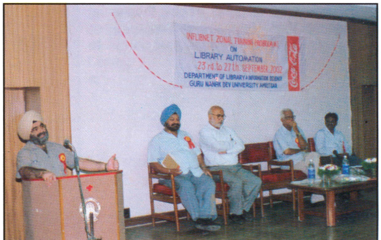
INFIBNET Regional Training Program at Guru Nanak Dev University, Amritsar.