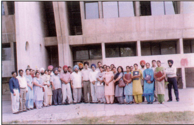
Participants of the Regional Training Program at Guru Nanak Dev University, Amritsar.