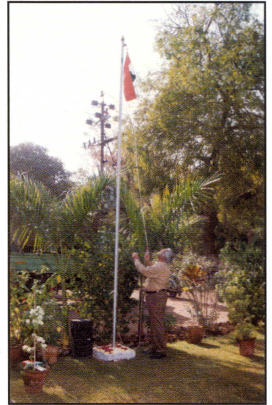
Sh. S M Salgar, Scientist-G, INFLIBNET Centre, hoisting the flag during Republic Day celebration on 26th January 2003.