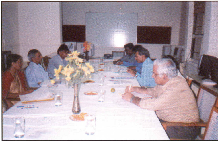
Members discussing the two important projects Retrocon and DDS at University of Hyderabad.