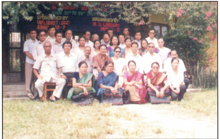
INFLIBNET Regional Training Program at Manipur University, Imphal.