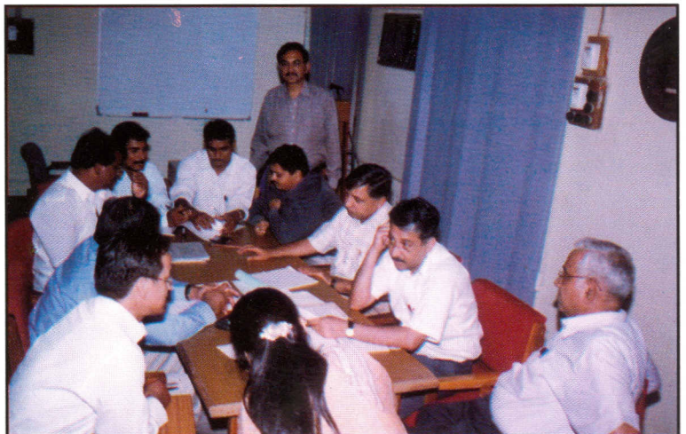
Technical Committee of MARC-21 implementation in discussion at INFIBNET Centre, Ahmedabad.