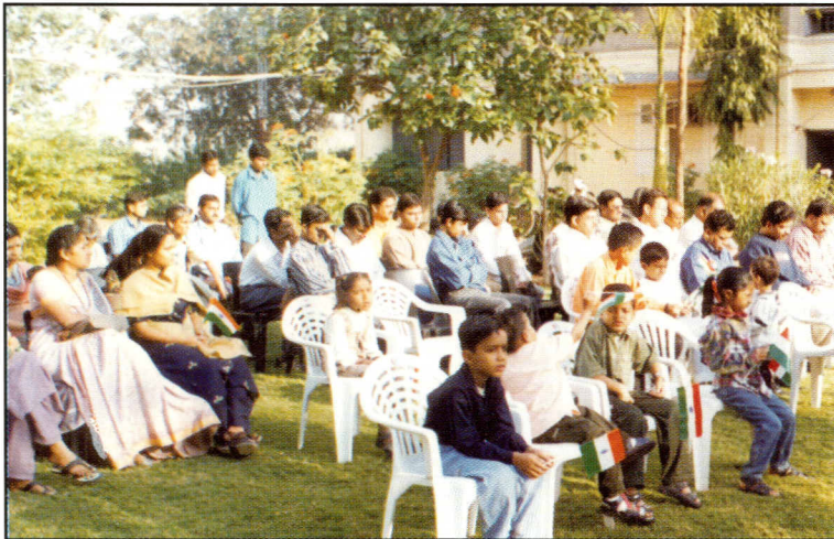
Staff and their family during the Independence day celebration at the Centre.