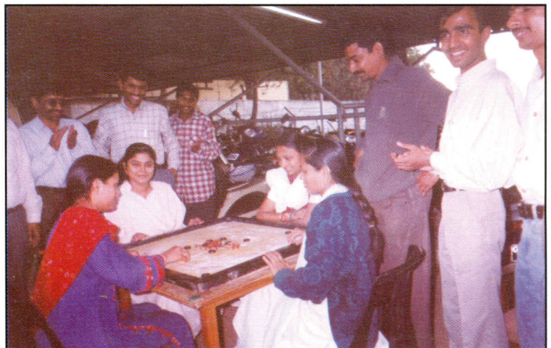
Staff of INFLIBNET in action during the sports events held under INFLIBNET Sports and Recreation Club.