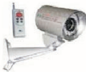
Fig. 3: High performance outdoor camera.

Fig.2 shows a mini dome camera. This camera provides 30-foot night vision, auto iris with 306mm lens, and covers an area of 30 ft x30 ft, with 420 lines of resolution.