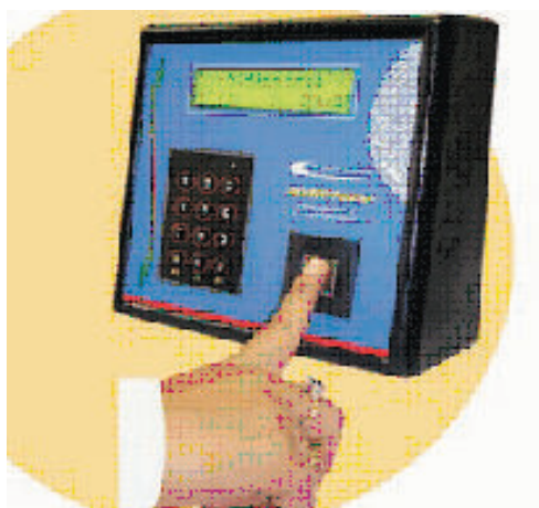
Fig.4 Jaypeetex’s manufactured Scan 4000 unit.

at present. The Jaypeetex has already launched their own manufactured fingerprint identification unit for access control and time & attendance Scan 4000, which is shown in Fig. 4. The government of India is planning to provide National ID cards and the required data has been already collected in 13 districts of 13 states from 3 million participants. The finger print data will be encoded in smart cards. Various state, police and city offices in Maharashtra, Andhra Pradesh, Karnataka and Kerala are trying to use finger print clock in systems for workers to ensure accuracy and punctuality of the employees.