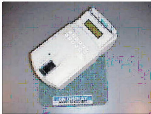
Fig. 5. Fingerprint scan device

constant monitoring, the misuse or theft of the books can be reduced to a great extent. Even if the library is spread into many floors, the cameras can be fixed in each floor and where ever surveillance is necessary. As a result of this arrangement, the tearing of pages from the books, hiding the books by the users, book theft and sitting in corners and gossiping can be reduced to a large extent. The models of a few devices for biometric systems used in libraries are given below. The fingerprint scan device is shown in Fig.5, while the facial recognition device is shown in Fig.6.