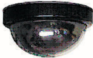
Fig. 1: Vari-focal dome color security camera.

Fig.1 shows a dome camera. It is an indoor color high-resolution mini dome camera with manual zoom lens. It provides manual zoom capability from 4mm to 8mm views. It can be operated with any standard video surveillance system.