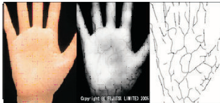
Fig.8. Fujitsu's palm vein authentication technology.

Fujitsu's library system is the first of its kind to implement contactless palm vein authentication technology to start cardless lending of library materials. With this, users will have simple and reliable access to library services without using an ID card. It eliminates concerns over unauthorized use of lost or stolen library ID cards. The Naka City Public Library in Japan has commenced the use of this system since October 2006.