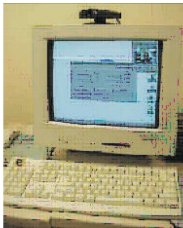
Fig. 6. MirosData Facial Recognition