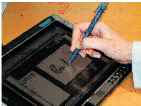
Fig. 9. Biometric signature verification device

The biometric signature verification system, shown in Fig.9, analyzes the act of writing and examines the pressure one applies while writing, the speed and rhythm with which one writes. This method also records the sequence in which one forms the letters. For example, some individuals may add dots and crosses as they keep writing or after they finish the word. These traits are very difficult to forge. Handwriting recognition system's sensors can include a touch-sensitive writing surface or a pen that contains sensors, which detect the angle and direction of writing as well as the pressure applied while writing.