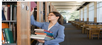
Figure 2.5 Library Staff with multiple books in hand causing RSI