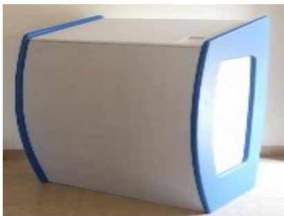
Figure 2.6 Self Check In Check Out Kiosk