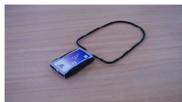
Figure 2.2 Handheld reader for stock management

RFID based system reduces repetitive scanning of individual items at the circulation desk during check in, check out and hence avoids RSI such as carpal tunnel syndrome