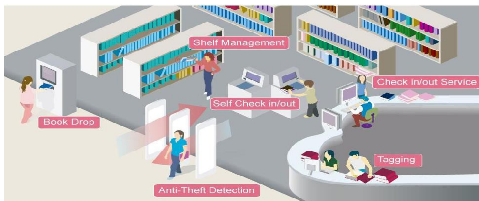
Figure 2.1 RFID enabled Library in action ( Ref. http://rfid-library.com/ )