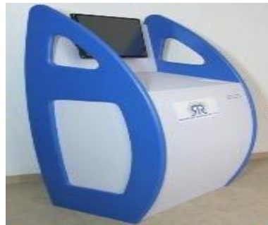
Figure 2.7 Book Drop Station