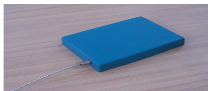
Figure 2.4 Desktop reader for Circulation