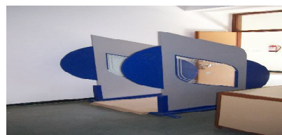
Figure 2.3 Security Gate Antennas