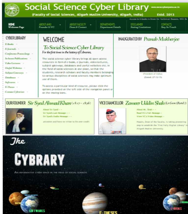
Figure: 1 Social Science Cyber Library

The Social Science Cyber Library is just another step towards providing access to content in Social Sciences not just insitu but exsitu as well. The following paper is an attempt to throw light on the inception and the role the Cyber Library is intended to play in the coming years.