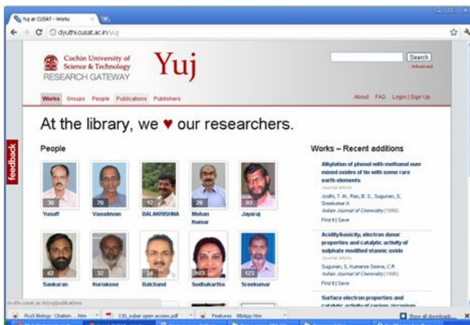
Figure 2: A Snapshot of Knowledge Gateway

Media Core provides an exceptional experience to any site delivering media to its users. Media Core can be used to organize video and podcasts, engage users and deliver content to both desktop and mobile devices. Media repository aims to archive in house video contents created within the campus, it covers the contents such as events happened in the campus, Featured, Student's Creation, Training, Lectures and invited talks, Conferences/ seminars and TV Shows etc. For organizations with video located on the social web and on its own servers, it can centralize everything onto one common platform.. It is powered by open source software media core.