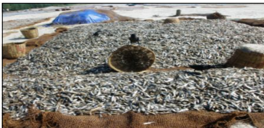
Figure 4: A Snapshot of Dry Fish Preparation

Traditional knowledge digital library of Cochin university of Science & technology supports the preservation of tacit knowledge, creation of new wisdom/knowledge by linking this indigenous knowledge with scientific knowledge. It also enhances the new knowledge economy of the Nation. It supports qualitative assessment of traditional culture; it supports the organizational research and knowledge based cultural change initiatives. Other complimentary factor for ensuring optimal information flow in fisheries sector, its research, economic, social and cultural growth.