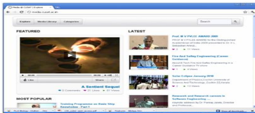
Figure 3: A Snapshot of Media Repository

The main aim of this TKDL is to explore the science behind the traditional knowledge of the fisherman’s community in their daily life such as prediction of the availability of fish species, whether forecasting, anticipation of problems, disaster warning, general fish habitat, medical applications of marine species, etc from their experience and knowledge transferred through generations for the improved, sustainable coastal resource management. This grandma’s knowledge will be documented and linked with scientific knowledge by developing a Traditional Knowledge digital Library (TKDL) of coastal resources.