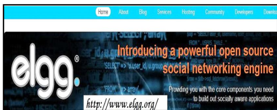
Figure2: elgg Home Page