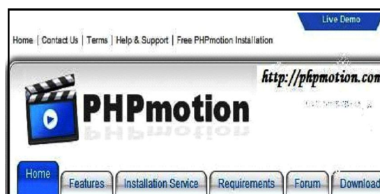
Figure1: PHPmotion Home Page

PHPmotion is a free video sharing software that also has support for other types of media such as audio/mp3 sharing. The Content Managent System will allow user to create and share video, audio and Picture. The librarian could host the video lecture of subject, conference and other event occurred with the institution and it will reach wide user with in minimum time.