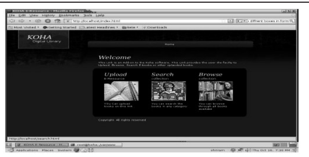
Figure 2& 3: The main interface for DL module where user can search/browse etc