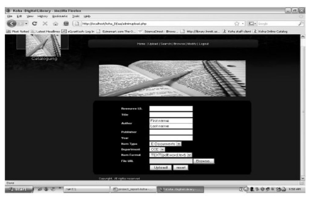
Figure 4: The main interface for DL module where user can search/browse etc

This interface facilitate user to catalogue the e-resources based on standard metadata. It provides facility to add the e-resources and to give some basic metadata like title, Author, Publishes, Department etc. We can also add the full text of the files in various formats like PDF, .AVI, .EXE etc. It supports all the file formats used today. Figure: 4 shows the metadata fields of this function.