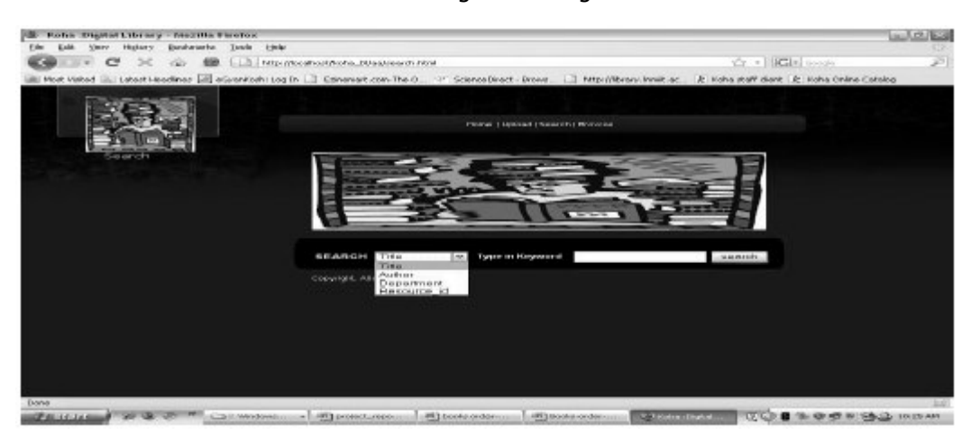
Figure: 5 Feature Available Through Searching

4.3. Searching: This feature facilitates the user to search the documents by metadata fields such as Author, title, resource-id/acc-no and department. This interface also provides the facility to further access the resources alphabetically. There is predefined structure to display the results. Figure: 5 Shows that the various feature available through searching.