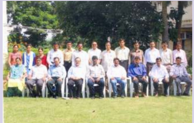
61st Training Programme on Installation and Operation of SOUL Software held during 20th to 24th August 2007.