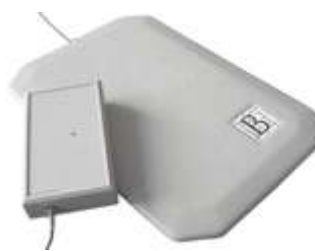
Fig. 5 – Reader (Platen) at Staff Station

for reading the item data and the user ID cards for checking in and out the items including the facility to print receipt of the items. It also allows identifying the library user either by a typical barcode library code or magnetic ID card or by a PIN number. The self-check out/in unit provides process of multiple items at the same time in a stack. The height of the read range is approximately 6 inches, thus the thickness of the items determines the number of items that can be checked out or in. The number of self-check out/in unit is depend upon the requirement of library according to the conjunction library have at the circulation counter. It helps in reducing the crowd magnificently at the circulation counter.