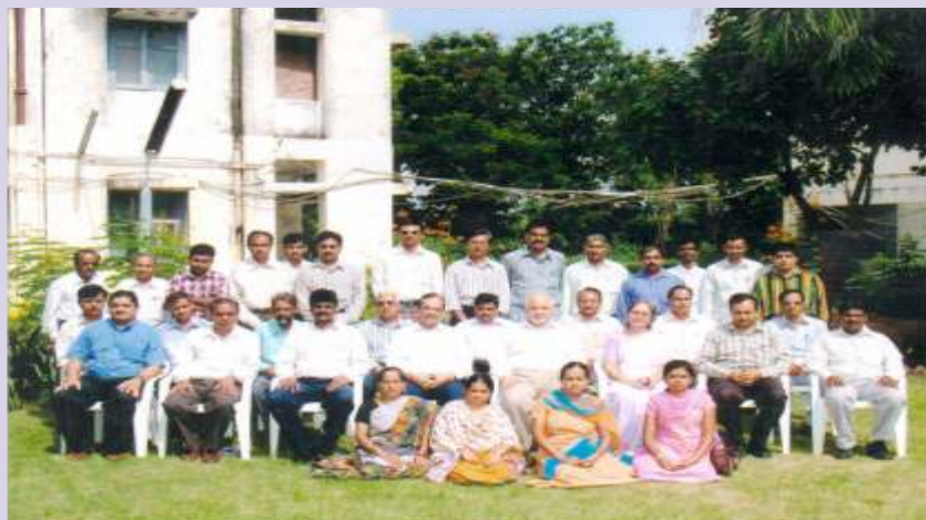
62nd Training Programme on Installation and Operation of SOUL Software held during 17th to 21st September 2007.