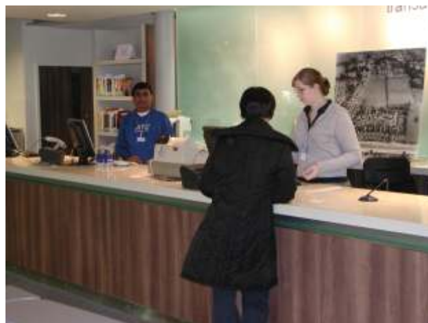
Fig. 6 - Staff stations