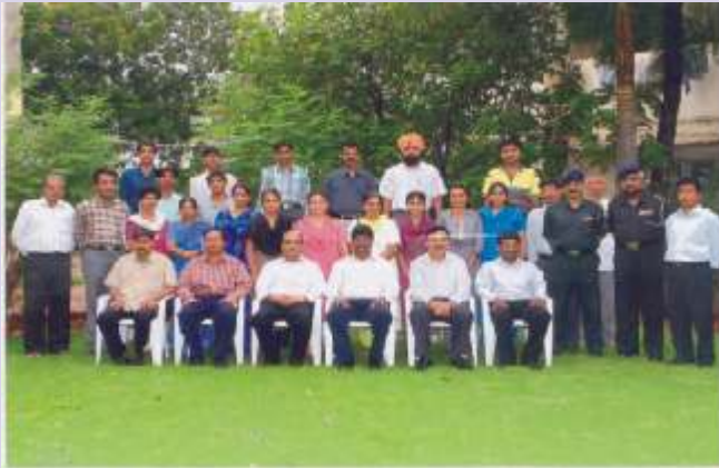
60th Training Programme on Installation and Operation of SOUL Software held during 25th to 29th June 2007.