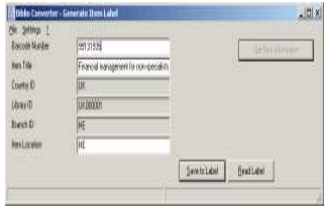
Fig.8 – RFID Converter