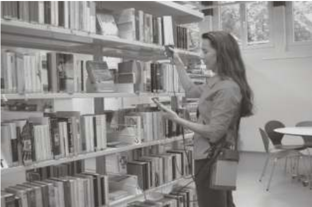
Fig. 7 - Magic wand

the missing items etc. The library specific software programme can also be written and utilized the magic wand data for specific purposes.