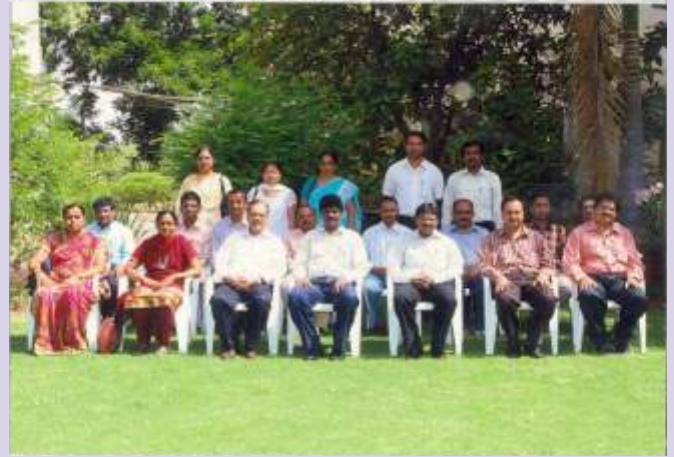
59th Training Programme on Installation and Operation of SOUL Software held during 28th May to 1st June 2007.