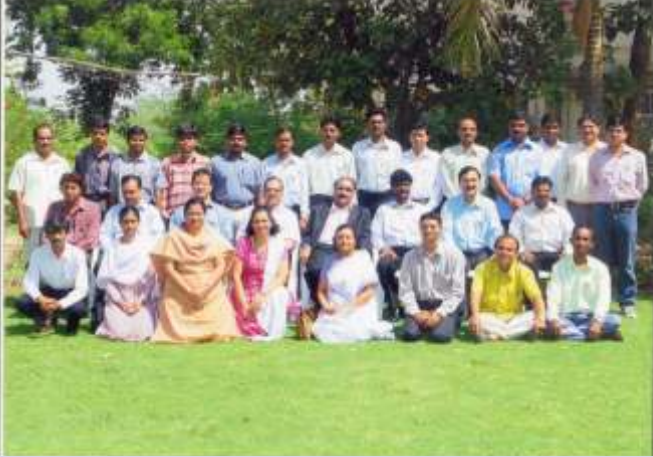
58th Training Programme on Installation and Operation of SOUL Software held during 23rd to 27th April 2007.