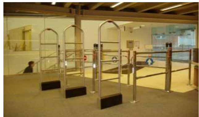
Fig. 3 - Sensor gates

The reader is designed like a sensor gates used in the stores for theft control located at the entrance / exit, where the reader consists of two or three antenna parallel to each other. The aisle width or distance between two antennas is 90cm (35 inches) and probably 1.8m (70 inches) for three antennas. Libraries use max. 4 sensor gates, two for exit and 2 for entrance with three antennas, but it is also possible to implement with two sensor gates, one for exit and one for entrance with two antennas