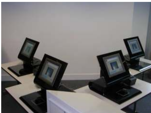
Fig 4 - Self check out/in units

The dimensions of the reader at the staff stations are mostly 240x340x9mm being set underneath of the counter, which should mostly be connected with a personal computer check out/in in a stack allows 6 inches of items equivalent to five books of medium size.