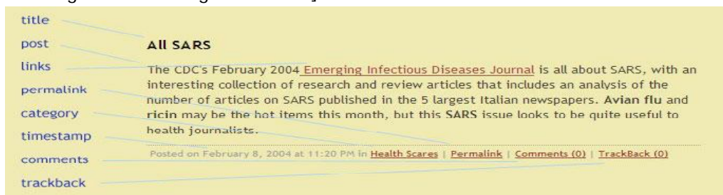
Figure:2 Anatomy of A Blog-Entry