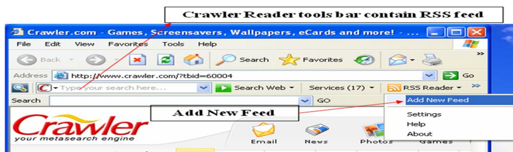
Fig.4. Add RSS feed using Crawler Reader.