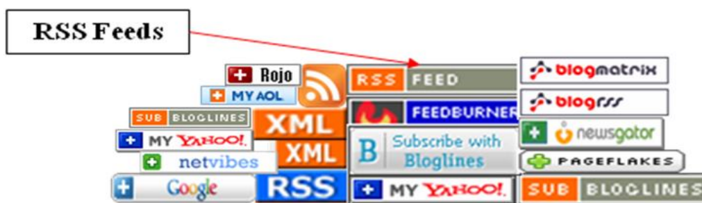
Fig.3 Popular rss-feeds

RSS (Real Simple Syndication/RDF Site Summary) is becoming one of the influential tools with growing number of task, such as headline syndication/news posting, eTocs, updating and locating content for library site. It allows a blog posting to be syndicated and fed to an aggregator. Generally RSS is a simple XML syntax, describing feed of recent addition to a website and/or weblog. The major applications of RSS to library through BLOG are listed below.