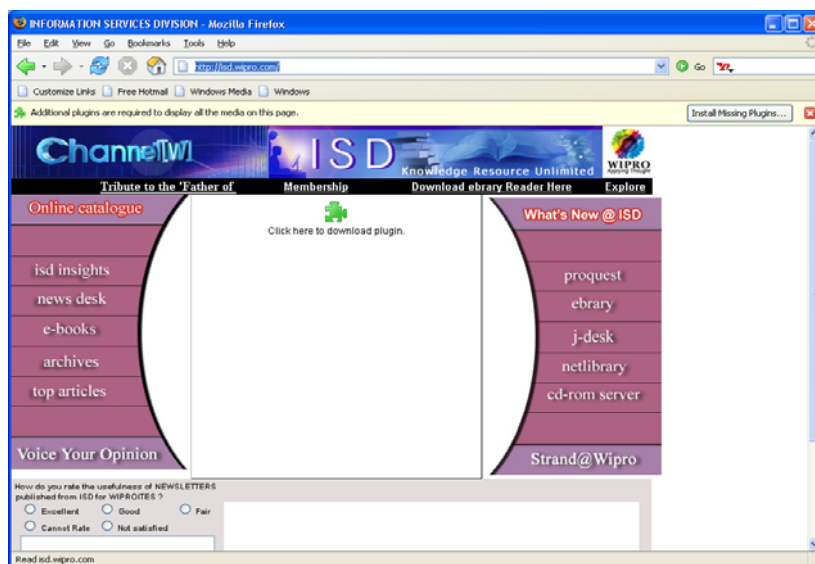
Fig - 1

Our ISD Wipro Technology homepage consists of various informative sections, which is accessible across the development centres with the help internet and intranet facility of our ISD sites. When we think of providing desktop Information, we need to think on what kind of information required for whom and how much! When we are clear about the information products, quantity and its users, we should think about the ways and means of making it available online and it is only possible through such infrastructure, technology, and manpower for managing web portals & services.