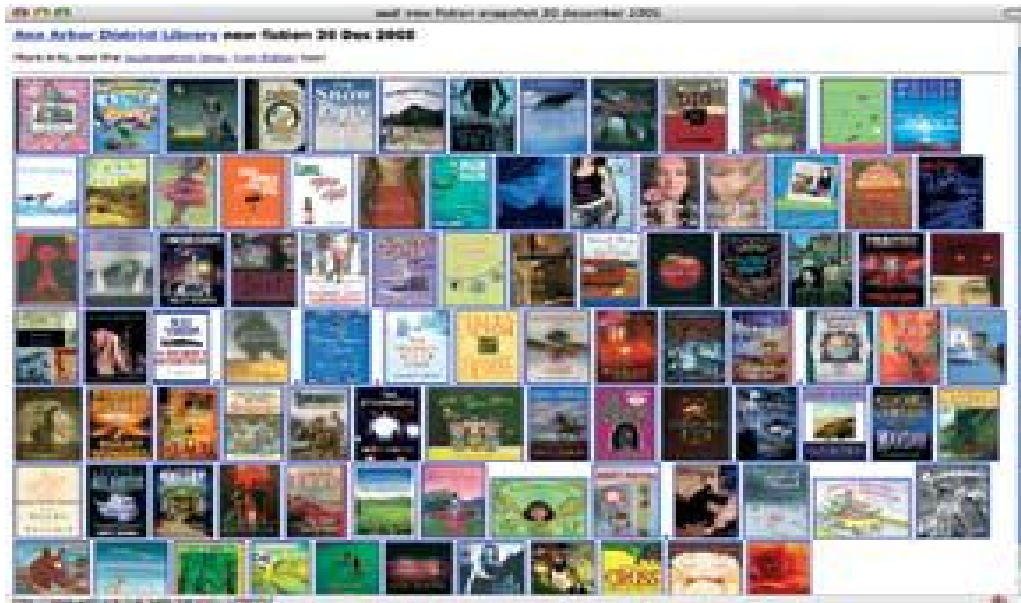
Figure 3: Vielmetti, a user of Ann Arbor's District Library, took information from the library catalogue about new books to automatically generate images like http://vielmetti.typepad.com/superpatron/2005/12/visual_wall_of_html