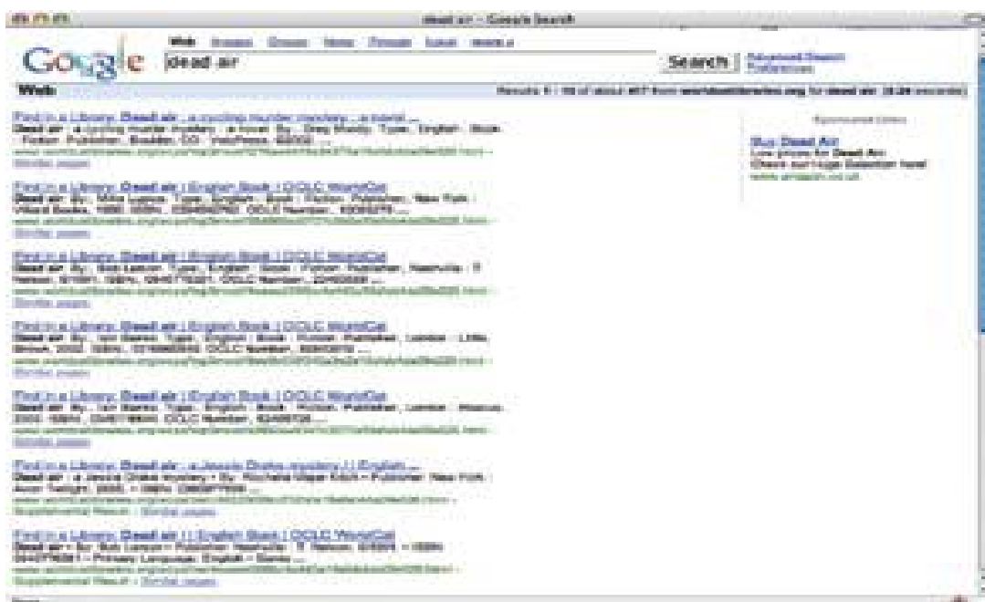
Figure 1: OpenWorldCat exposes information about the holdings of libraries making it visible to search engines such as Google.

Exposing basic information about the institution and its services, the open library should seek to enable discovery, locating, requesting, delivery and use of the resources in its care. For example, physical library holdings might usefully become far more visible than they are now. OCLC has made important progress in this area, and their OpenWorldCat initiative allows searchers to find books held by participating libraries in popular search engines such as Google and Yahoo.