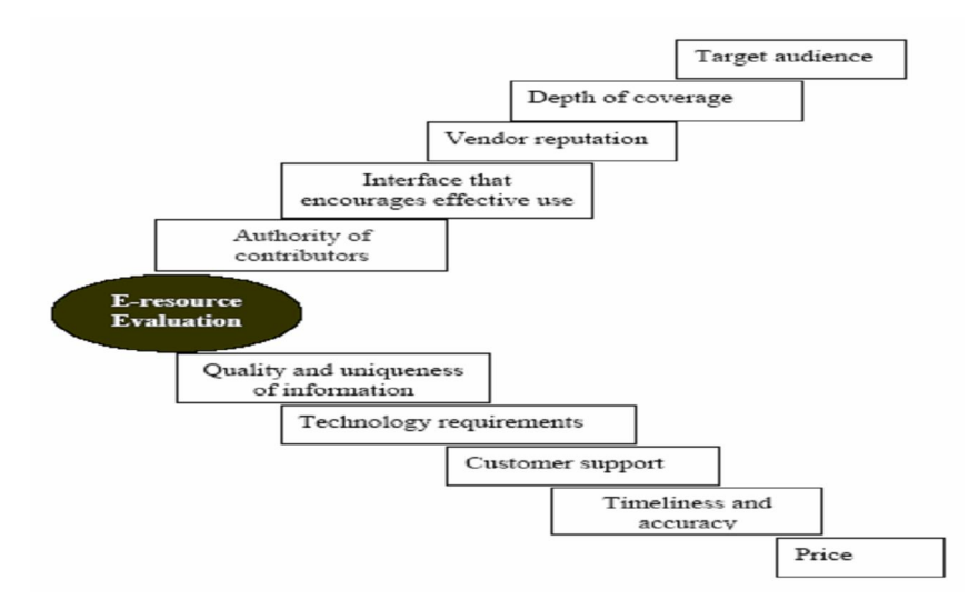
5. Argument in Favour of Procurement and use of e-resources

Methods of evaluation may include comparisons to similar products, demonstrations, literature reviews, and peer consultation. Criteria may include: