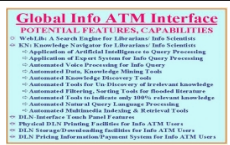
Fig 2: Global Info ATM Interface with possible features and capabilities

Every Library should have an Info ATM Interface infrastructure for accessing the Digital Libraries Network for local, national, regional and global access to digital information resources. This Info ATM should be like Bank ATM with facilities like Printing, Storage, Downloading, Printing Facilities, Big Touch Screen with integrated access to library resources and DLN-based digital resources.