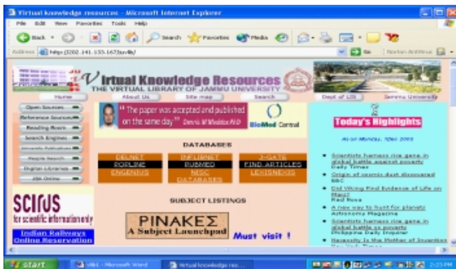
Fig 2: Open Sources