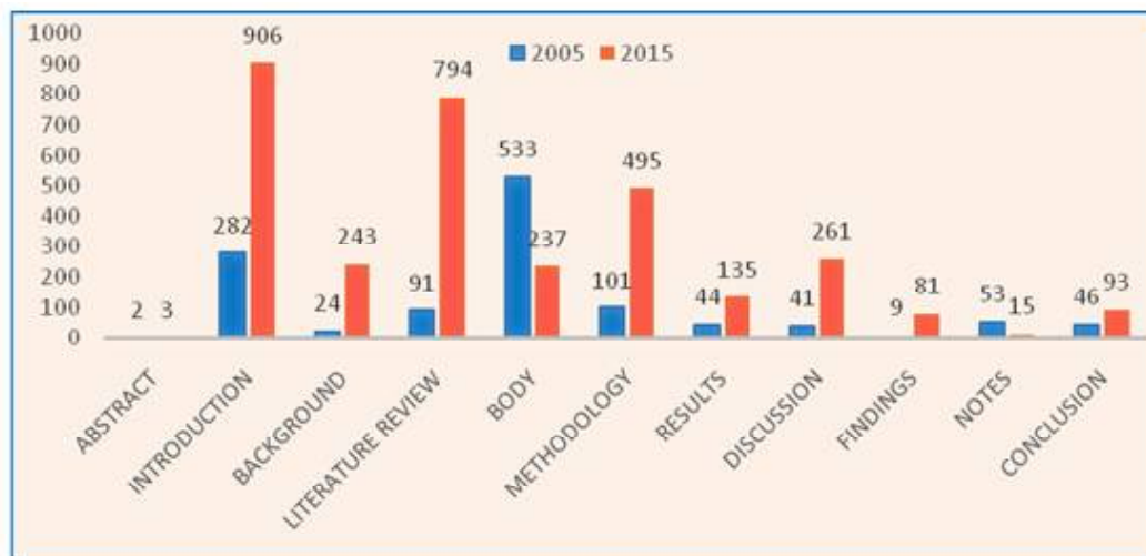
Figure 2: Citation Concentration in 2005 and 2015 Volume

The figure shows the concentration of citation in different parts of the article. Here, the most cited part is introduction with 1,188 citations followed by literature review part with 885 citations, next to it was the body portion with 770. The least cited part is abstract part with only 5 citations.