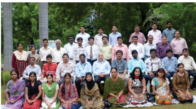
◀ Participants of 104 th Training Programme on SOUL 2.0 with the Director and Technical Staff of the INFLIBNET Centre