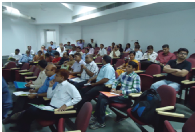
Participants of the Awareness programme on e-resources subscribed under UGC INFONET Digital Library Consortium and N-LIST Project