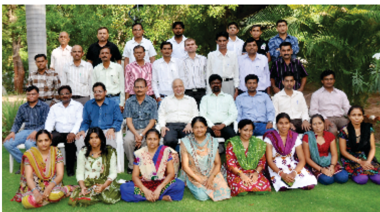
◀ Participants of 102 nd Training Programme on SOUL 2.0 with the Director and Technical Staff of the INFLIBNET Centre