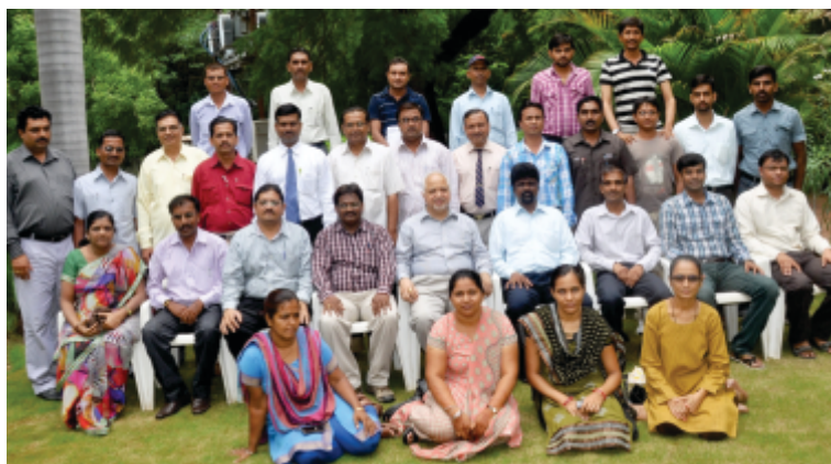
▶ Participants of 103 rd Training Programme on SOUL 2.0 with the Director and Technical Staff of the INFLIBNET Centre