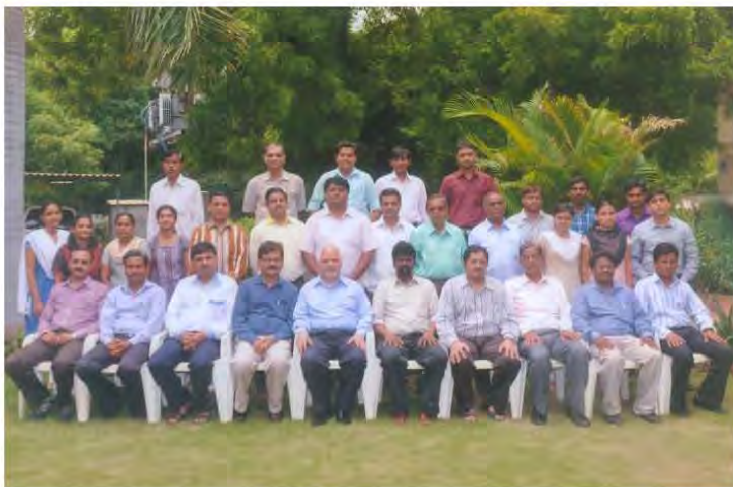
Participants of 95 th Training Programme on SOUL 2.0 with the Director and Technical Staff of the INFLIBNET Centre