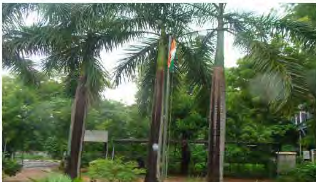
National Flag Hoisted at the INFLIBNET Campus on the occasion of Independence Day

various activities and services rendered by the INFLIBNET Centre to higher education institutions in India. Various games were organized for the staff and their families during the day. The programme concluded with distribution of gifts to the winners and sweets to all the attendees.