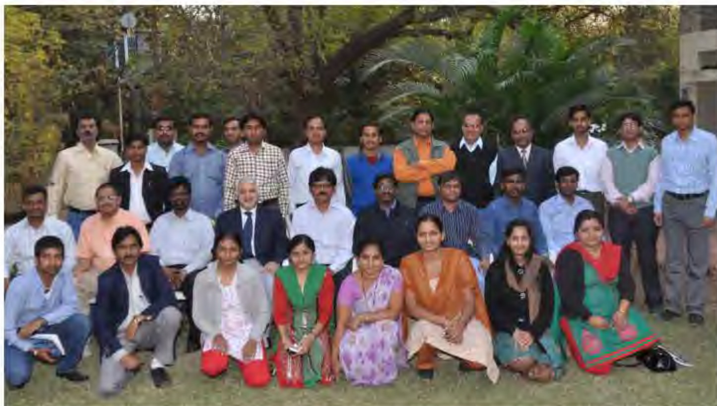
Participants of 99th Training Programme on SOUL 2.0 with the Director and Technical Staff of the INFLIBNET Centre