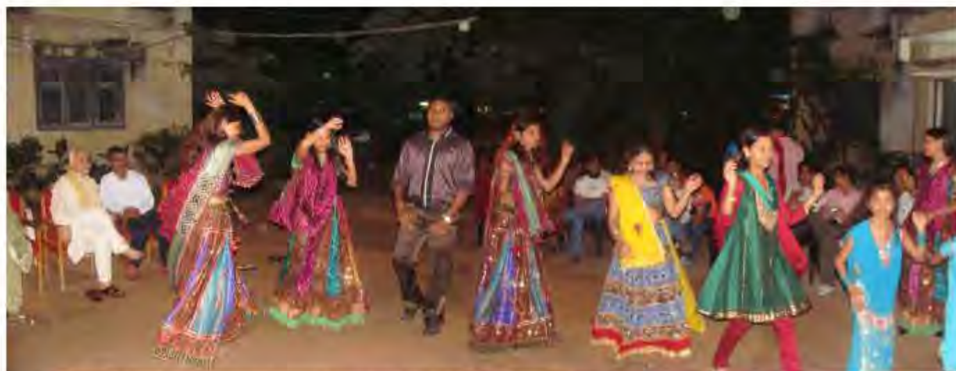
Participants performing dance during the Garba Celebration at the INFLIBNET Centre on 4 October 2011