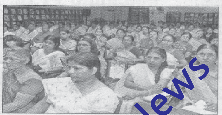
Principals, teachers and research st ning to the guests on the occasion.

■ Staff Reporter gwo stroy it like hos RAIPLIR Apr 28