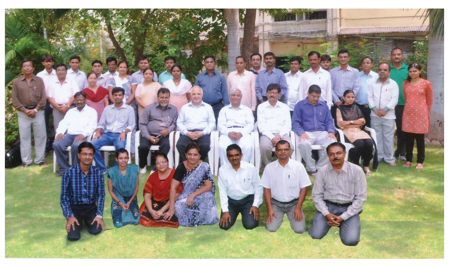
Participants of 92nd Training Programme on SOUL 2.0 with the Director and Technical Staff of the INFLIBNET Centre