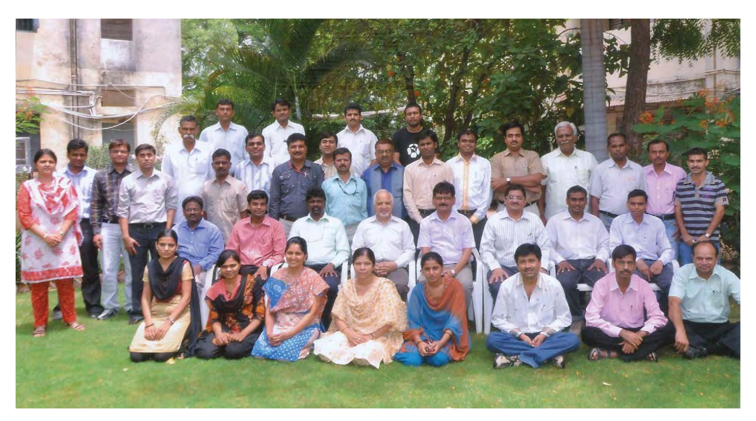
Participants of 93rd Training Programme on SOUL 2.0 with the Director and Technical Staff of the INFLIBNET Centre