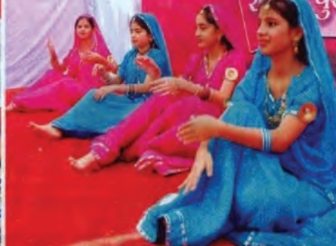
नेबार को अबेडकर सर्किल पर चल रहे नेवानल बुक फेथर में बड़ी संख्या में स्टुबेंट्ल और चुवाओं ने उत्सह के साथ किलायें खरीदी। साथ ही बुक फेक्ट में स्टॉस्ट्रालिक कार्कक्रमों का आयोजन भी किया गया।

जयपूर। यहां पहुने के लिए एक से बहुकर एक हिन्दी और इस्लिल भाषा में लिखी गई जुस्स उपलब्ध हैं। पहुने के लिए अपने मन्जेब्द की बुक्त भी और सहित्य, संस्कृति, इतिहास, जनरल अवेयरोस, धार्मिक और भी देरी विश्मी की पुस्तकें यहां रहेगी को पसंद