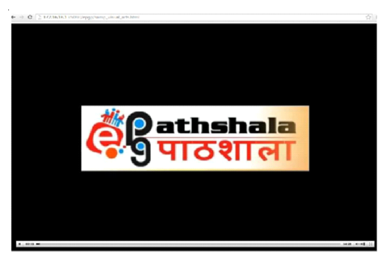
Figure 5: Red 5 Media Sever Output

The below figure shows the snapshot of the live stream from RED 5 media server.