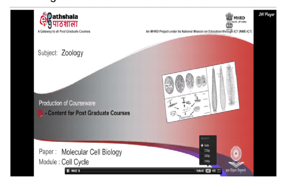
Figure 7: Output of Multi-Bit Rate Streaming

The output of multi-bit rate streaming is shown in below figure: