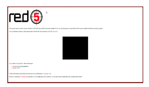
Figure 3: Red 5 Server Start Page

Now navigate browser to http://localhost:5080/, you will get your server ready.