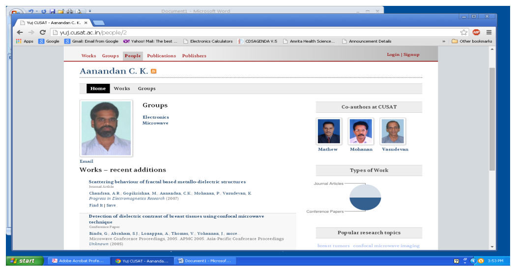
Screen Shot of BISSAT Works