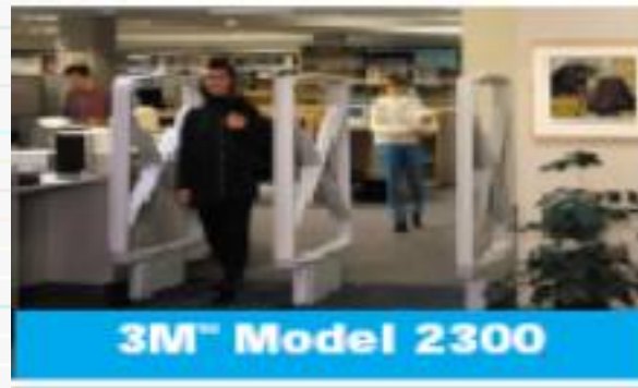
Fig. 1 Electromagnetic Gate

magnetic strip inserted in each book of the Library. Any unauthorized exit of library material will produce alarm to alert the library staff.