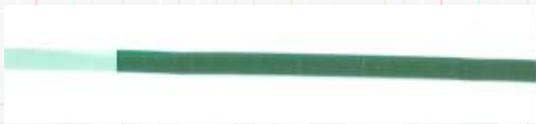
Fig. 3: 3M™ Tattle-Tape™ B1 Security Strips (adhesive one side)