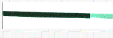
Fig . 4: 3M™ Tattle-Tape™ B2 Security Strips (adhesive both sides)