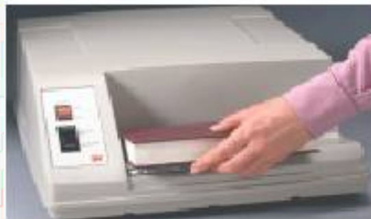
Fig. 2 Sensitizer/ Desensitizer Unit

• Sensitizer / de-sensitizer unit: 3M - 995 workstation de-sensitizes each book that is issued out and re-sensitizes each book that is returned to the Library.