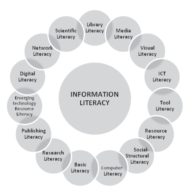
Figure-1 Components of Information Literacy

Literacy Scientific Literacy, etc. They are called to be skill based literacy's which are collectively represented in the Figure-1 below: