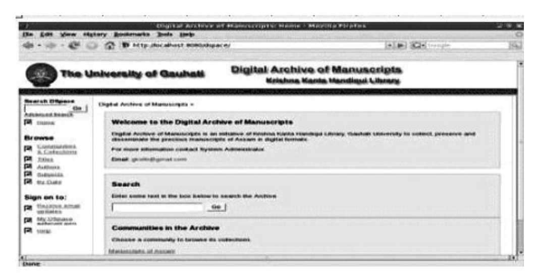
Figure 2: Home page of Digital Archive of Manuscripts: KKH Library

Figure no. 2 will be the homepage of Digital Archive of Manuscripts: KKH Library. From the home page users can access the manuscripts opting the navigation keys e.g. "Communities and Collection", "Titles", "Authors", "Subjects", & "By Date". He can also use the "Search option" to search his required document. "Advanced Search" option is for sophisticated search using Boolean operators.