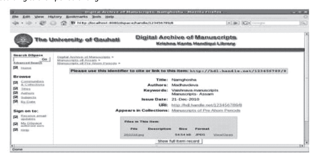
Figure 4: An Item or Manuscript Entry with Metadata

There will be one top level community, e.g., "Manuscripts of Assam". Under this community three collections will be created namely- "Manuscripts of Pre Ahom Period", "Manuscripts of Ahom Period", and "Manuscripts of Post Ahom Period". All manuscripts will be uploaded in these three collections according to their period of origin.