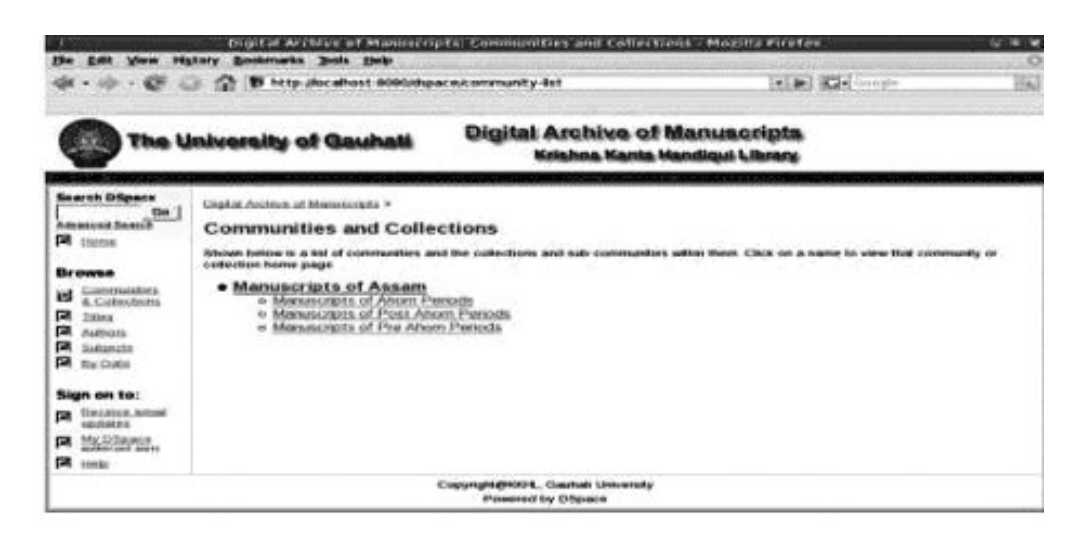
Figure 3: Communities & collections of Digital Archive of Manuscripts: KKH Library

Figure no. 2 will be the homepage of Digital Archive of Manuscripts: KKH Library. From the home page users can access the manuscripts opting the navigation keys e.g. "Communities and Collection", "Titles", "Authors", "Subjects", & "By Date". He can also use the "Search option" to search his required document. "Advanced Search" option is for sophisticated search using Boolean operators.