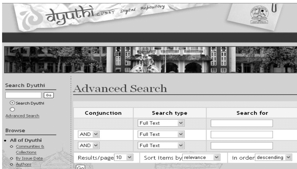
Advanced Search options of CUSAT ETD