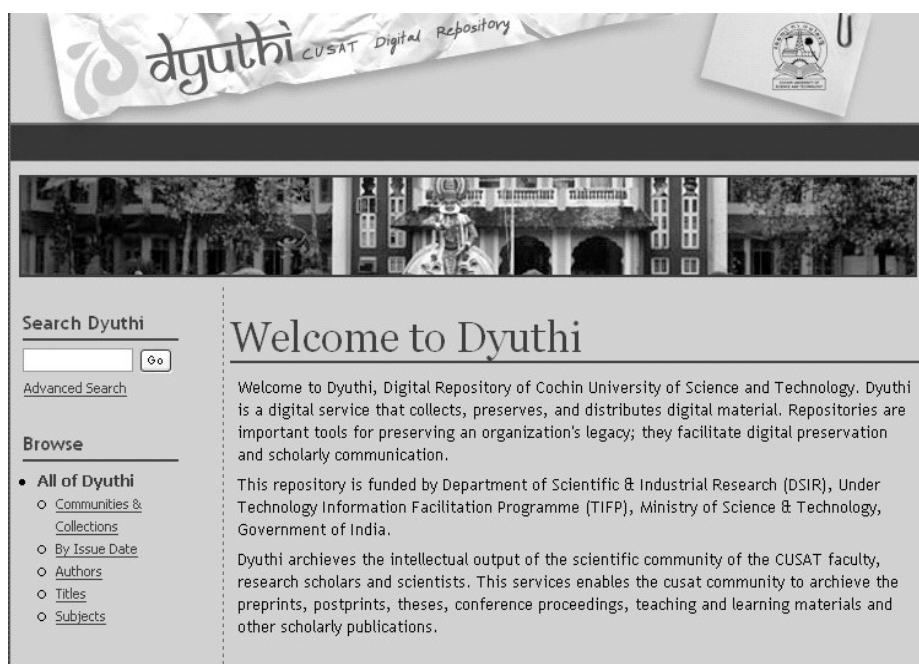
Home page of CUSAT ETD http://dyuthi.cusat.ac.in/xmlui