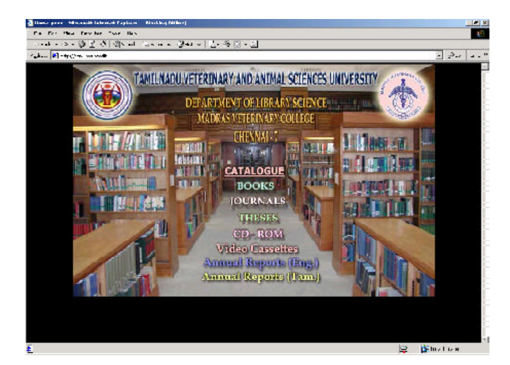
Fig. 1. First page of the Library OPAC