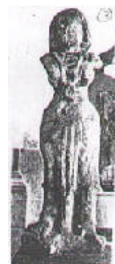
3. Besnagar Yakshi