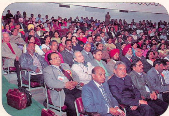
Audience during the inaugural session.