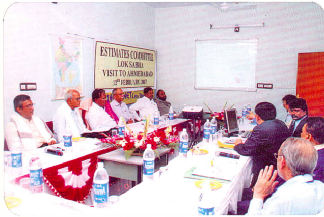
The Estimate committee of the Lok Sabha, visited the INFLIBNET Centre on study tour on 12th February, 2007