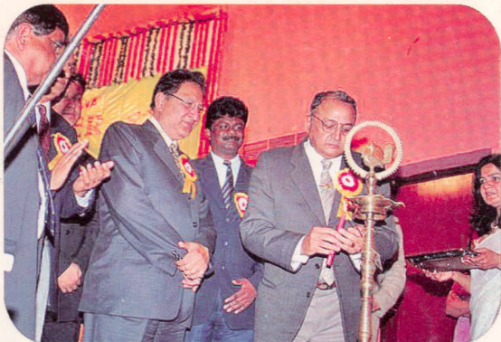
Gen. (Retd.) S F Rodrigues, Governor of Punjab & Administrator UT of Chandigarh inaugurating the CALIBER-2007 by lighting the lamp.