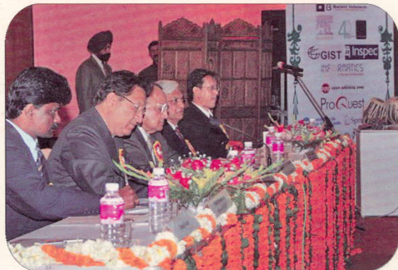
Inaugural session of the CALIBER-2007