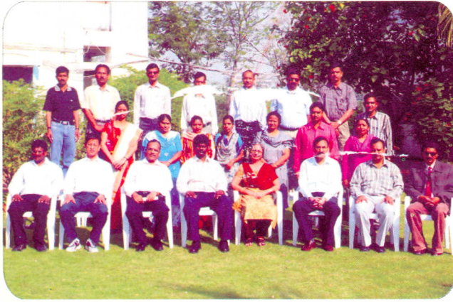
Participants of 56th Training Programme on Installation and Operation of SOUL Software, held during 26th February to 2nd March, 2007