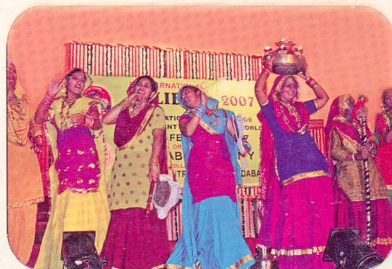
Cultural evening at CALIBER-2007