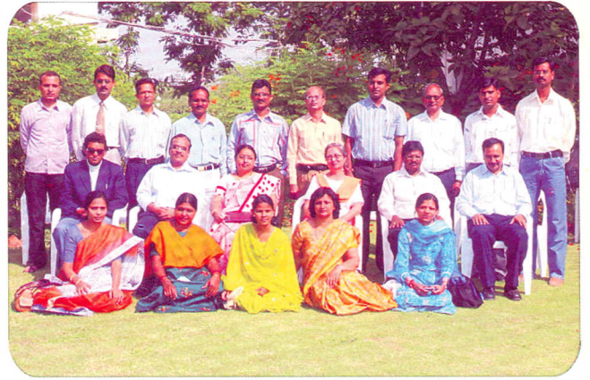
Participants of 57th Training Programme on Installation and Operation of SOUL Software, held during 19th to 23rd March, 2007