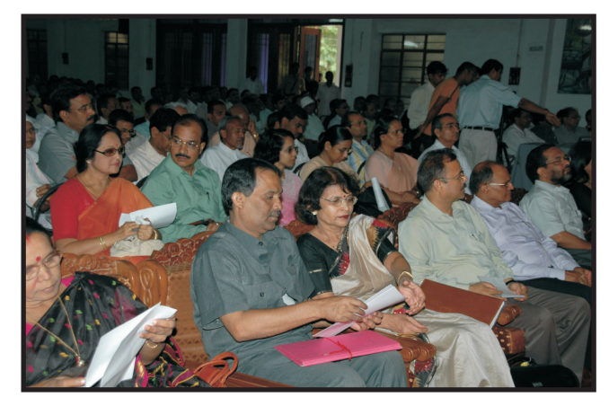
Audience of UGC Sponsored INFLIBNET Awareness Programme for the Colleges of Bihar and Jharkhand States.