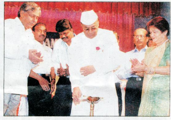
इंफ्लीबनेट पर आयोजित कार्यशाला का उद्घाटन करते राज्यपाल।

इंफ्लीबनेट के बारे में जानकारी देने के लिए शनिवार 24 जून को संत जेवियर्स कॉलेज में कार्यशाला आयोजित की गयी। कार्यशाला का