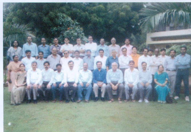
Participants of the Fifth batch ICAR-INFLIBNET Training Programme for Agriculture Librarians on "Networking and E-Resources Management".