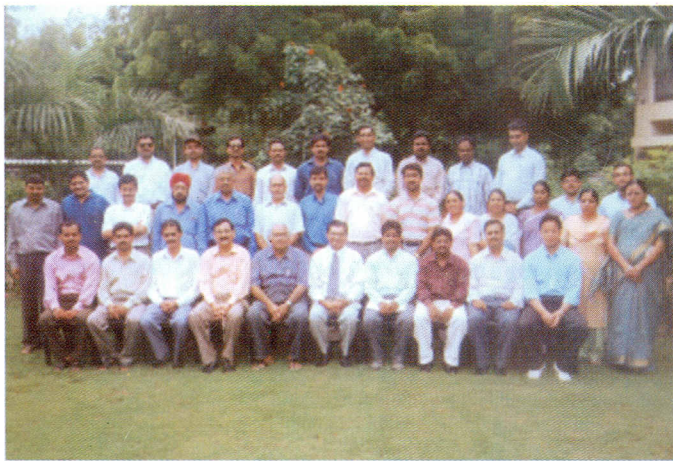
Participants of the Sixth batch ICAR-INFLIBNET Training Programme for Agriculture Librarians on "Networking and E-Resources Management".