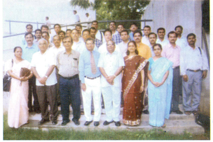
Participants of the Fourteenth Training Programme on SOUL Software.