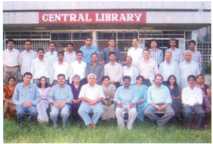
IRTPLA programme at Maharshi Dayanand University, Rohtak