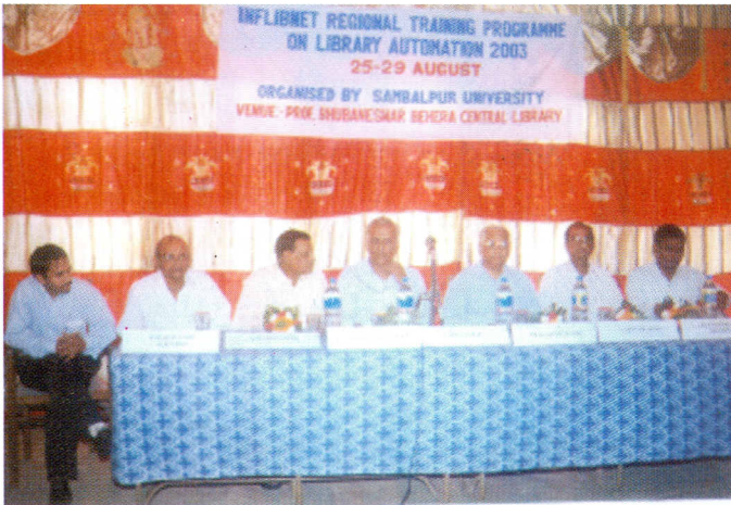
IRTPLA programme at Sambalpur University, Sambalpur