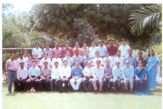
Participants of the Seventh batch ICAR-INFLIBNET Training Programme for Agriculture Librarians on "Networking and E-Resources Management".