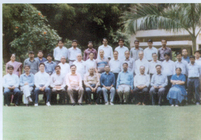
Participants of the Third batch ICAR-INFLIBNET Training Programme for Agriculture Librarians on "Networking and E-Resources Management".