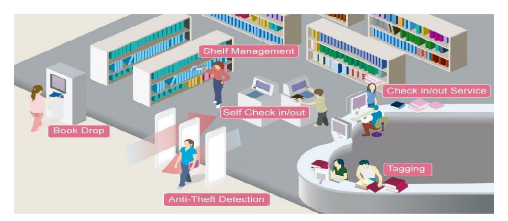
Figure 2.1 RFID enabled Library in action ( Ref.http://rfid-library.com/)