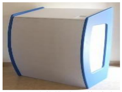
Figure 2.6 Self Check In Check Out Kiosk