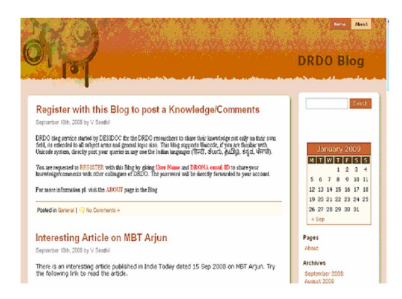
Figure – 2 Schematic of DRDO Blog on DRDO Intranet

The DRDO blog is powered by Word Press 2.0. The software is having MySql as back-end and PHP as front-end running on Red hat Linux server. It supports themes, so any time its look and feel can be changed without loss of any data. The archives of posting/comments are also maintained month wise.