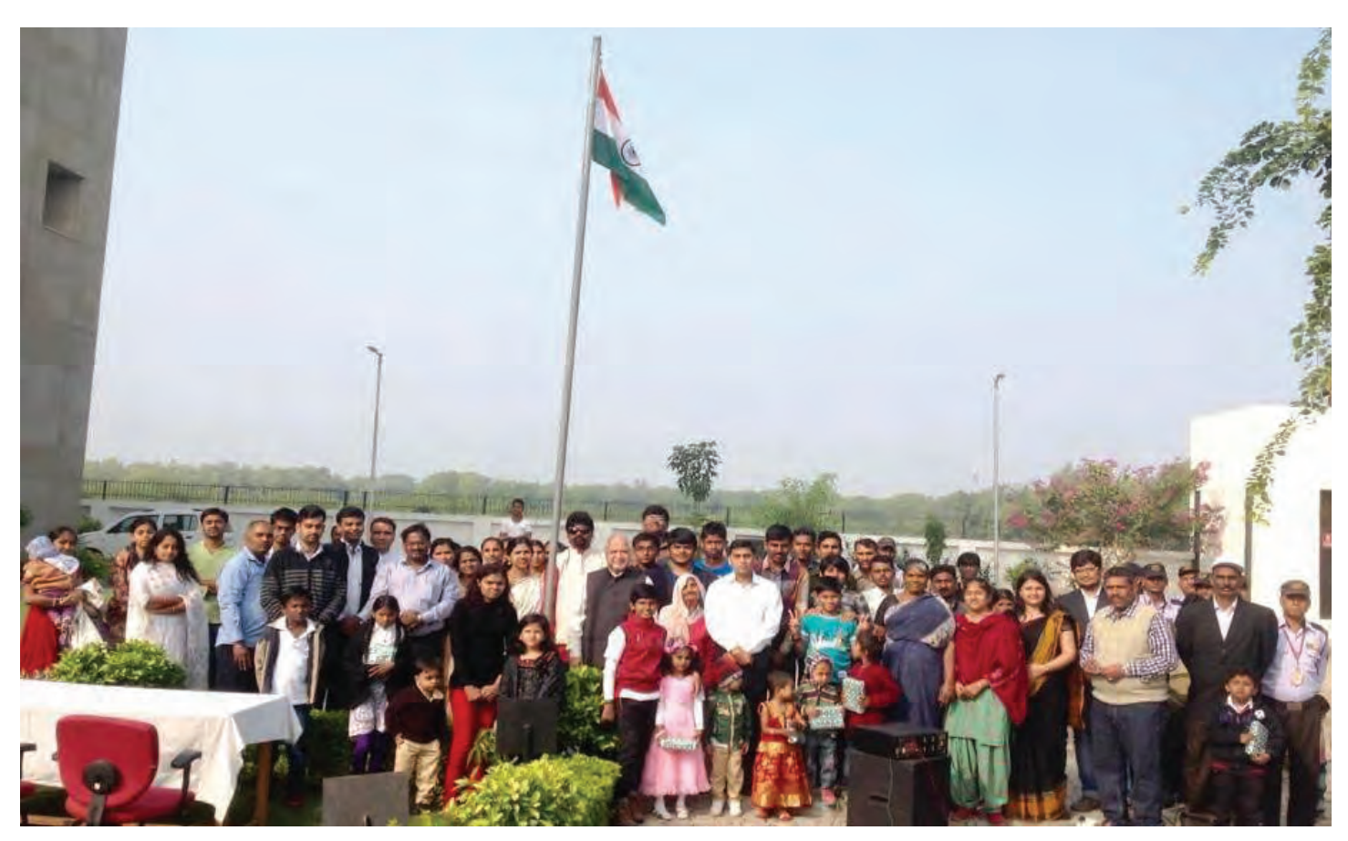
68th Republic Day celebration with staff members and their families at INFLIBNET Centre, Gandhinagar

addressed the staff members and their families about the activities of the Centre. A number of games were organized for staff and their children during the event and prizes were distributed to the winners of the games.